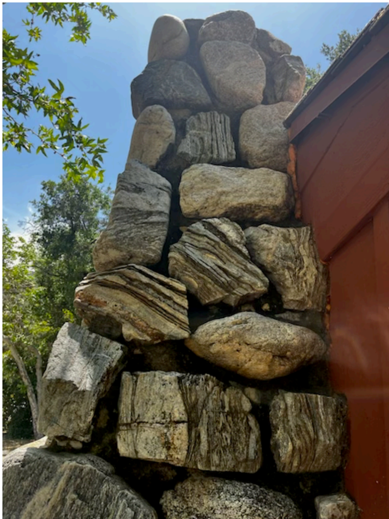
Outside View of Fancy Rock Fireplace