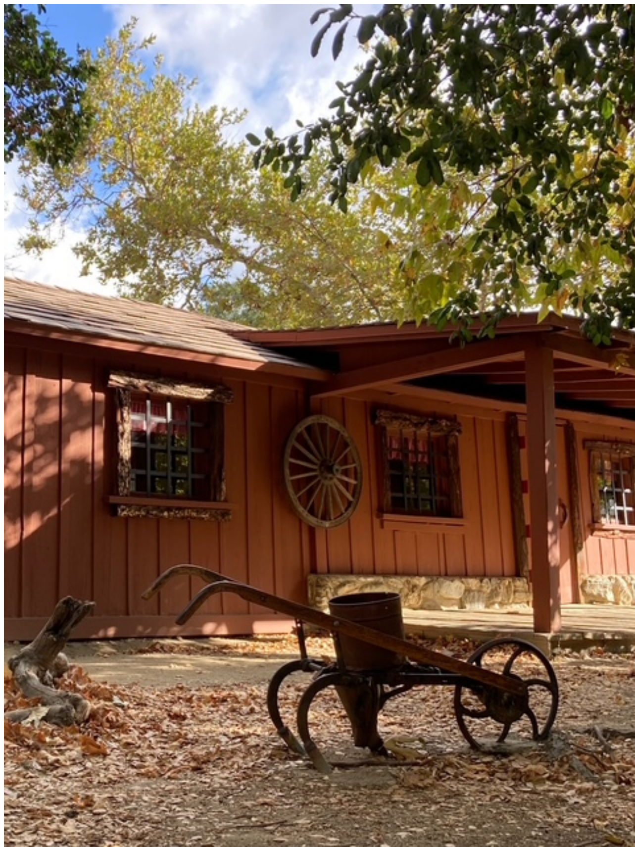
Walker Cabin in the Sunlight with Vintage Plow