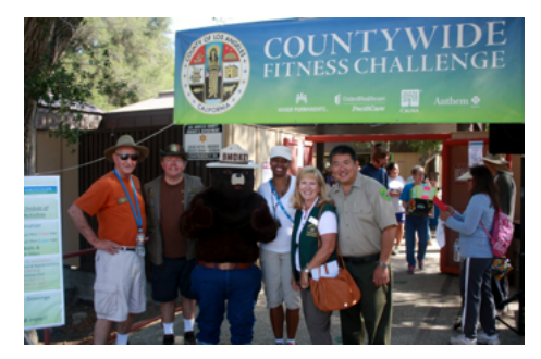
Los Angeles County once again chose Placerita as the site for their County Wide Fitness Challenge . We have become quite popular for this event, with more people attending and staying around after the hike to explore the center. Of course, it didn't hurt that The Local Group (astronomy), the Herpetology Society and Animal Tracks were all set up to engage weary hikers upon their return.